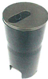
Deck Jet 500

Bring the beauty of moving water to your customers' backyards with Hayward's new family of water features.