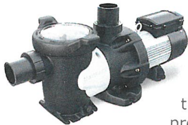
HCP 3000 Series

The new pump is offered with a wide range of power options providing an optimum solution for virtually any pool while delivering maximum performance and uncompromised efficiency.